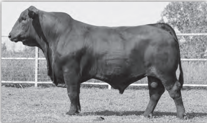
Lot 42 | TANNER STONEWALL 271F

He is a Stonewall son and a moderate, wide bodied Ultrablack. He is way good and boasts top 25% Milk and REA and top 30% IMF EPDs in a big topped and power packed phenotype.