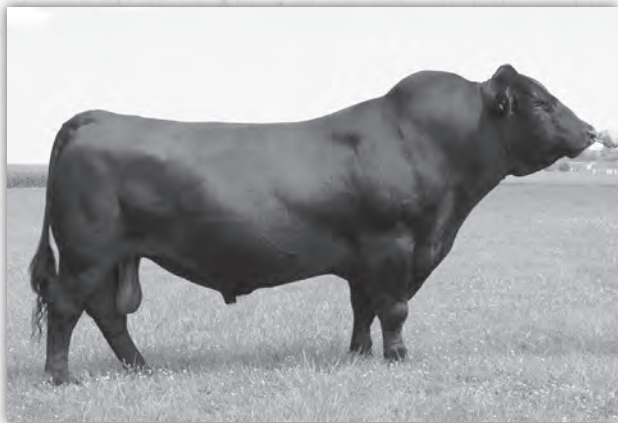
Quaker Hill Rampage 0A36