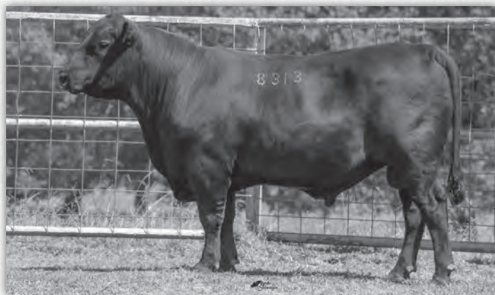
Lot 66 | TANNER BLUESTEM 8313

He posts top 35% of the breed WW EPD. His dam records 4 with a 373 day calving interval.