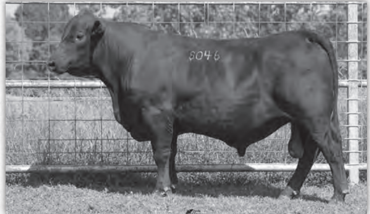
Lot 103 | TANNER CASANOVA 8046

He is a son of Whitestone Casanova. His dam posts a 346 day calving interval on 2.