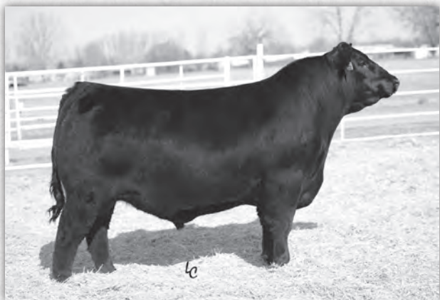
Mohnen South Dakota 402