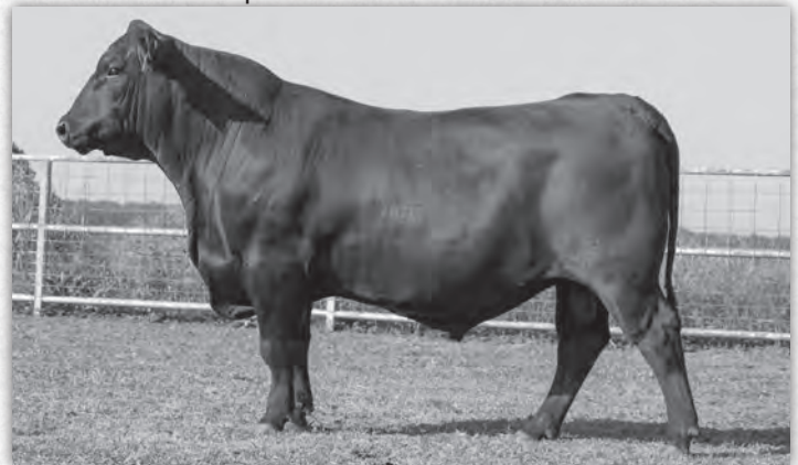
Lot 23 | TANNER 0A36 RAMPAGE 8114

He is the biggest growth bull we have offered in this sale. He ranks in the breed's top 1% WW and YW, 2% REA and top 10% $B. He is sired by Rampage and his dam posts 4 @ 106 WR.