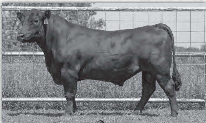
Lot 67 | TANNER MICHELANGELO 8063

This thick made Resource son boasts top 20% of the breed REA EPDs. He is out of a Record Harvest dam.