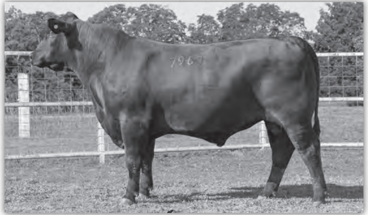
Lot 19 | TANNER 0A36 RAMPAGE 7969

This Rampage son is also a power bull. His donor dam and the dam of the previous lot are full sibs by Genesis. She posts 5 @ 107 WR. 7969 records top 15% WW, 20% YW, 25% Milk and top 15% $W and 20% $B.