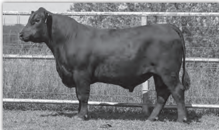
Lot 30 | TANNER ENERGY 8073

He is a powerful herd sire in a moderate package. Sired by Whitestone Energy, he writes top 15% WW and YW EPDs. His Final Answer dam posts 3 @ 101 WR and a 380 day calving interval.