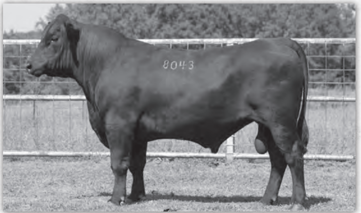
Lot 9 | TANNER ENERGY 8043

He is another powerful bull with Schaff breeding on the top side and his dam is Objective bred. He records top 15% WW, 10% YW and top 25% $B. His dam has been a tremendous producer for us with 5 @ 108 WR and 106 YR.