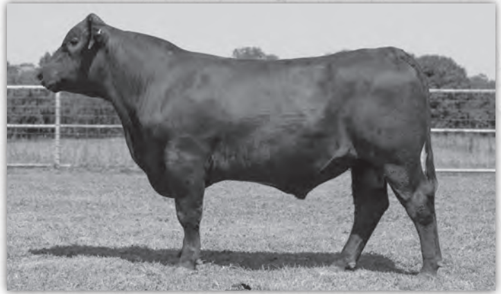
Lot 73 | TANNER ARMANDO 8223

He is sired by the Tanner Genex/CRI sire, Whitestone Armando A074. His dam is out of an EXT son we raised and his dam posts 4 @ 118 IMF ratio.