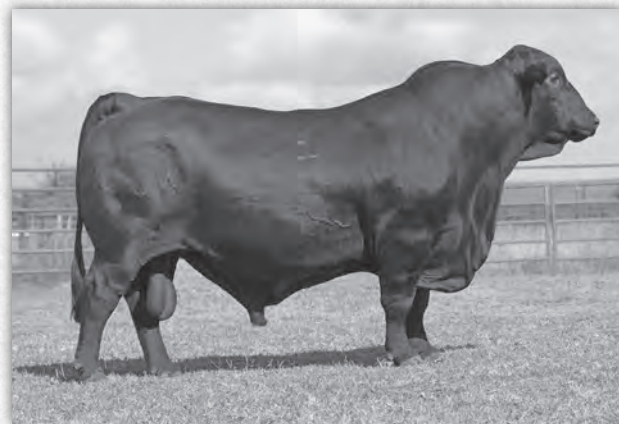
RRR Stonewall 222W6