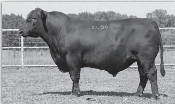
Lot 6 | TANNER DESTINATION 8056

He is a carcass king ranking in the breed's top 5% for $B driven by top 15% REA, Marb and Fat, with plenty of growth. His Ten X dam posts 2 @ 110 WR and a 373 day calving interval.