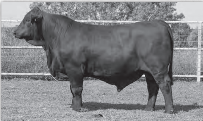
Lot 49 | OAKS SOLUTION 894F

This powerful Solution son writes 10 EPD traits ranking in the breed's top 35% or greater led by top 10% WW and YW, 30% REA and top 35% IMF and Fertility Index.