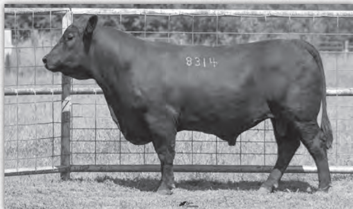
Lot 33 | TANNER HISTORIAN 8314

Sired by Buford Historian he records top 10% milk and top 35% CED. His dam posts 5 @ 101 WR.