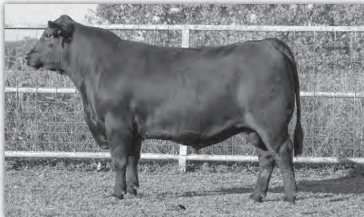
Lot 61 | TANNER 6594 ALLIANCE 7961

He is a Ten X grandson and records top 20% $B, 25% WW and Marb and top 30% YW and REA. His Tour of Duty dam calved him at 23 months of age.