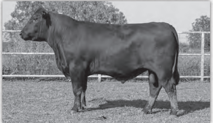
Lot 21 | TANNER 5003 ENERGY 8110

He records top 10% $B and REA along with top 35% Marb. He is by our Hoover Dam son and his dam is by 7L Destination 1036 and she posts 3 @ 104 WR.