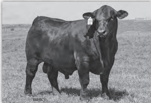
Atlanta of Salacoa 488Z