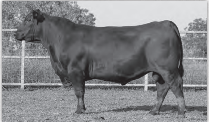
Lot 16 | TANNER 2100 GENERATION 7967

This son of VAR Generation 2100 boasts top 15% WW, CW, REA and $B EPDs and indexes with top 20% YW. His dam is a first calf heifer and ratioed him at 113 WR.