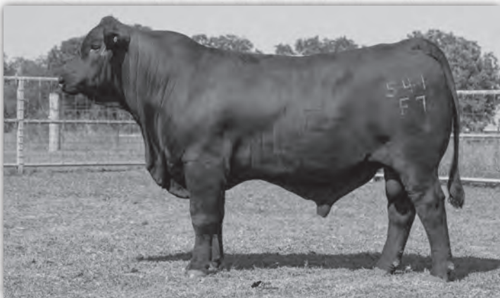
Lot 43 | OAKS 99C68 PASSPORT 541F7

Recommended for Heifers or Cows He features top 3% CED, 25% BW and REA and top 20% IMF EPDs. Big topped and deep sided he blends Passport, L11 and Csonka breeding in a pleasing cowman's package.