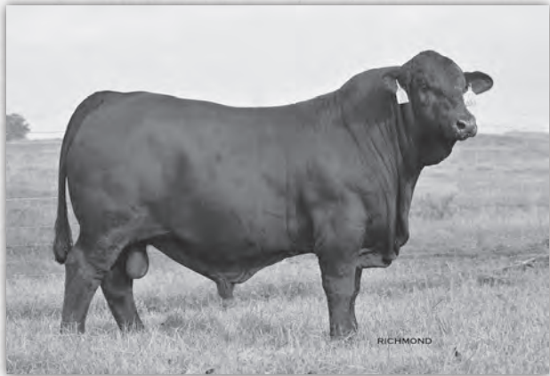
Hollywood of Salacoa 23A53