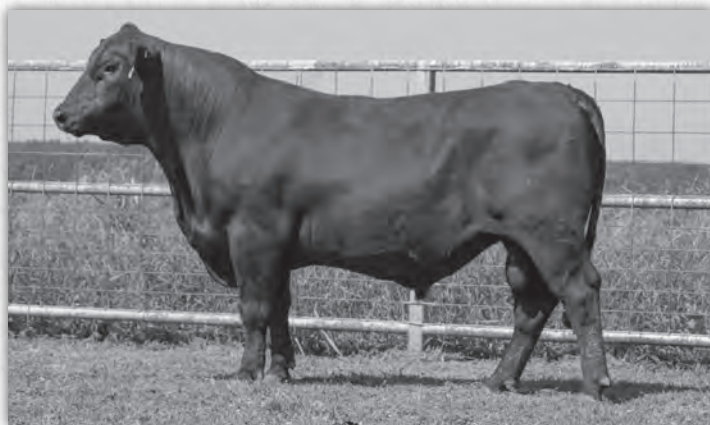
Lot 87 | TANNER HIGH SIERRA 8211

We start this pen of bulls with a bigger made son of Tehama High Sierra. He boasts top 5% YW, 10% WW and top 25% $B.