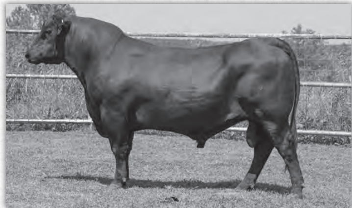
Lot 29 | TANNER Z29 NIAGARA 7929