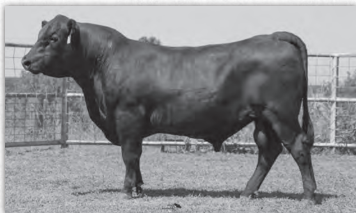
Lot 1114 | TANNER BLUESTEM 8258

He is a Buford Bluestem Y923 son and balanced in his traits with top 35% REA EPDs. His dam posts 5 @ 103 WR and a 356 day calving interval.