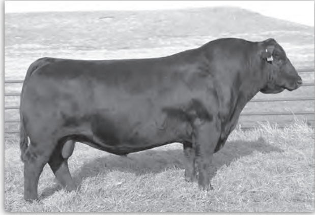
S A V Platinum 0010