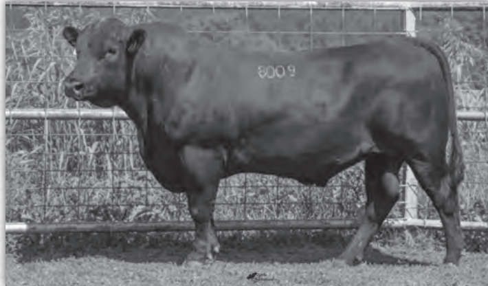
Lot 88 | TANNER 4834 PEDIGREE 8009

This calving ease son of SAV Pedigree projects top 25% WW, 35% YW and 30% Milk. His donor dam has earned Pathfinder status and posts 5 @ 109 WR.