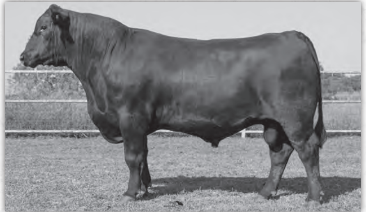
Lot 81 | TANNER 0010 PLATINUM 7934

By SAV Platinum, he is a calving ease herd sire prospect with plenty of growth ranking in the breed's top 30% WW and 35% YW. His Pathfinder dam is a donor for us and posts 10 @ 110 WR.