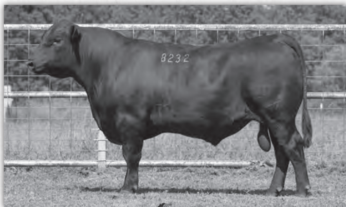
Lot 1 | TANNER 5615 SENSATION 8232

He presents curve bending EPDs recording top 35% YW and top 40% BW along with top 30% CW. In a big bodied and easy doing package, his dam records 2 @ 102 WR and a 316 day calving interval.