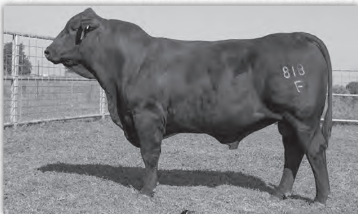
Lot 121 | TANNER ULTRABLACK 818F

He features straight Cow Creek breeding both top and bottom.