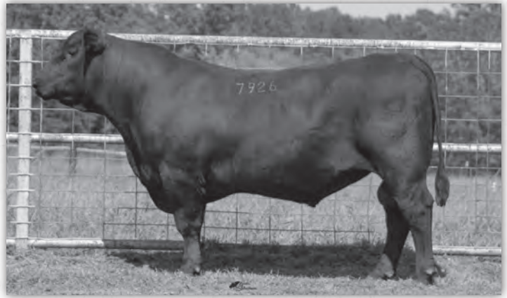
Lot 7 | TANNER 0A36 RAMPAGE 7926

He is a big powerful Angus bull. He boasts top 30% CED and top 2% WW, 3% YW with top 1% REA and 5% $B. Sired by Rampage and out of a Black Granite daughter, his dam calved him at 2 and ratioed him at 111 WR.